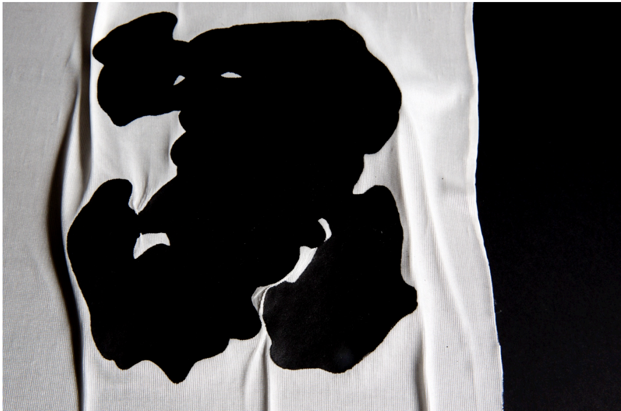
Figure 6. Interaction with other fields sparking inspiration and diffusing knowledge. Experimental Textile Sample, “High Tide”, Matilda Tuure, 2016

Inspired by notions of viscosity and control, design student Matilda Tuure investigated the visual potentials of magnetic phenomena through experiments with ferrofluids and iron oxide. The “High Tide” project is an artistic exploration of movement and patterns generated with variety of magnetised viscous mixtures on different surfaces using magnets as a tool. Tuure took the initiative of communicating with the Aalto University, Applied Physics department, acquiring insight and material samples. This example demonstrates how the interaction with other fields of study can stimulate innovative approaches and instigate diffusion of knowledge.