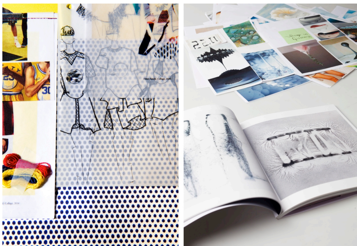
Figure 1. Examples of Visual Research Books developed by students. Left Image: Elina Äärelä, 2016 – Right Image: Matilda Tuure, 2016

The Initial task is to develop two mood-boards through translation of notions into visual elements. The students first open a discourse within their topics, by drawing associations and references through variety of aspects such as cultural, social, political, economical, and emotional, as well as techniques, products, and materials. To further solidify the concepts, the students are acquainted with notions of mood, context and target to establish the themes and identify the objectives of the projects.