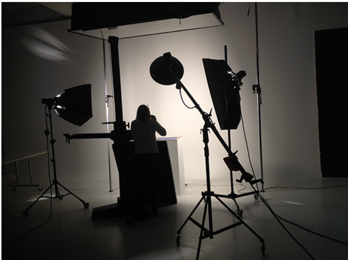
Figure 4. Photo and Presentation Workshop, Photo-Shoot session of student Kia Rossi, 2016

The concept of the Photo and Presentation workshop relates to marketing and branding of a developed product. Conducted as the final stage of the ETD module, in this workshop all students document the outcomes of their research, experimental samples, and collaborative projects. Students creatively produce powerful graphic content by means of set-ups, still-photos, videos and animations within the photography studios. Employing a hands-on approach, this workshop is used as a story telling tool for students to cohesively communicate the concepts and statements of their projects through high-quality and impactful visual presentations. This workshop highlights the importance and power of well-executed presentations to effectively communicate the outcome.