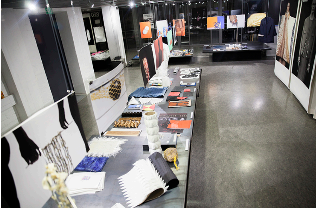
ETD Exhibition, School of Arts, Design and Architecture, Aalto University – 2016