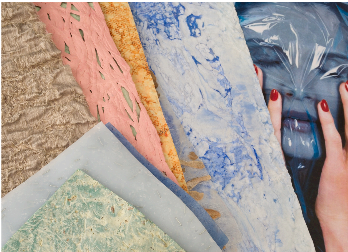
Figure 2. Experimental Sample Collection through Visual Research, Helmi Liikanen, 2016

More importantly, the organization of thoughts through diverse visual media creates a communication "bridge" among engineering and design students that allows for crossing over field specific terminologies and mind-sets.